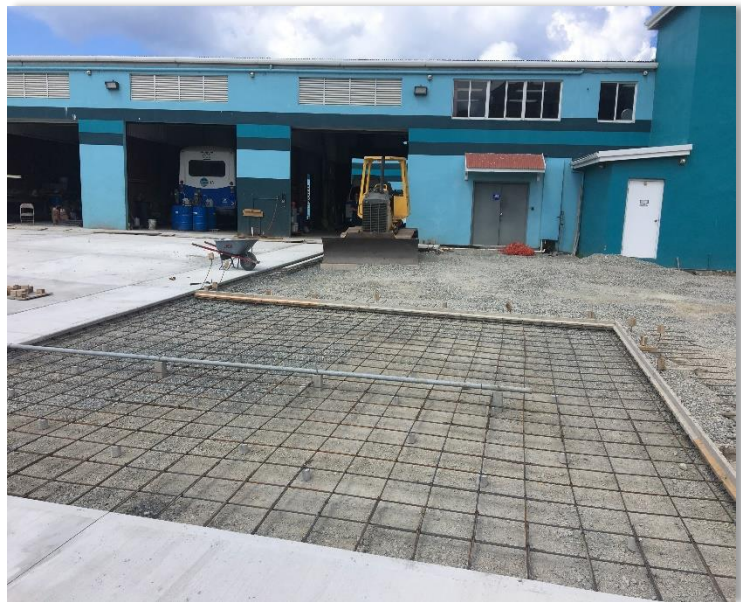
VITRAN Operations & Maintenance Facility – St. Thomas