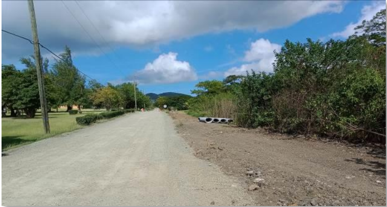
Roadway Aggregate Base Course near 35+00 (North View)