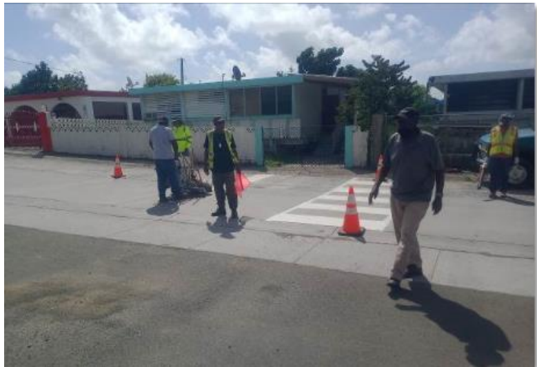
Placing Crosswalk at Lew Muckle School (South View)