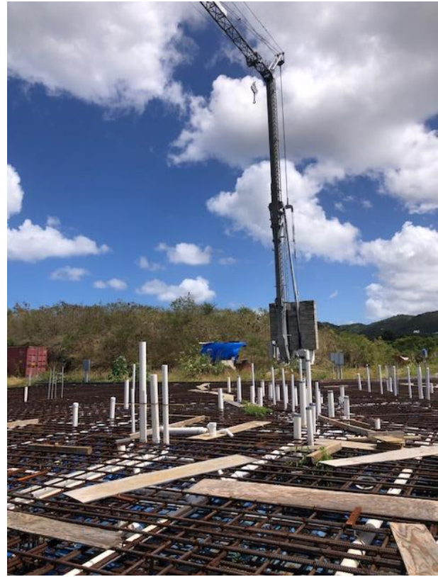
Current Image of Paul E. Joseph Stadium Construction

Pile driving was completed in September 2019. The installation of reinforcing steel and concrete fill of the pilings was completed in February 2020. Slab utilities, as well as the installation of utilities and 3' thick concrete slab is currently underway. However, due to the pending Conditional Letter of Map Revision (CLOMR) review, the project has been on hold awaiting FEMA response. It is anticipated that the FEMA review will be completed on or before Summer 2021.