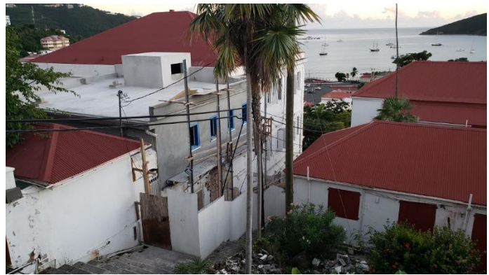
Current Image of Government House - St. Thomas under Construction

The project scope entails mold remediation; roof repairs; water damage repairs; ADA compliance; as well as updating the electrical, plumbing and internet to 2018 code standards. This project is funded by FEMA at a cost of $4,515,872.39 and the contract ends on March 14, 2021.